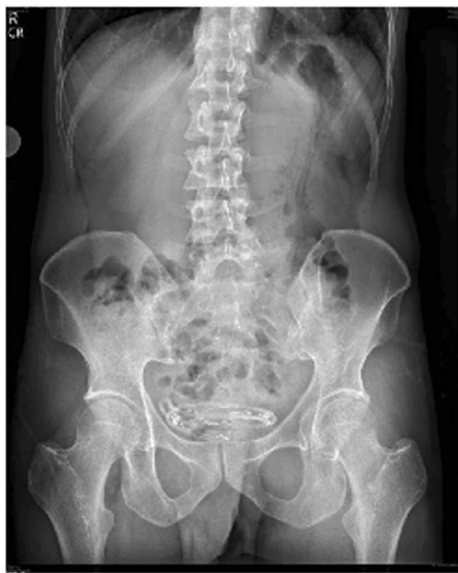
Figure 1. KUB X-ray showing radiopaque, coiled metallic densities consistent with intravesical foreign bodies in the pelvic region (2025).

routinely. A Foley catheter was left in place for two weeks. Postoperative care included oral antibiotics and resumption of olanzapine under behavioral medicine supervision.