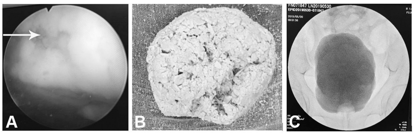
Figure 2. A) Cystoscopy showing a large, fibrinous mass (arrow) in the urinary bladder lumen; B) Gross specimen – re-constituted after endoscopic evacuation; C) Intra-operative cystogram showing a smooth bladder outline and no demonstration of a fistula.