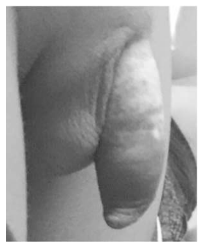
Figure 10. Day 21 Postoperative picture of penile strangulation