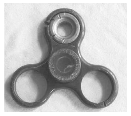
Figure 4. Fidget spinner

satisfactory recovery of the wound. Follow ups at the 1st, 2nd and 3rd week post - operatively where patient reported normal erectile function and noted good wound healing. (Figures 7,8,9 &10).