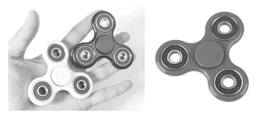
Figure 1. Fidget Spinner.

are marketed as gadgets that can eliminate stress, anxiety disorder and attention deficit hyperactivity disorder (ADHD). However, there are no peer-reviewed studies nor scientific evidence to support the idea that they have therapeutic qualities.