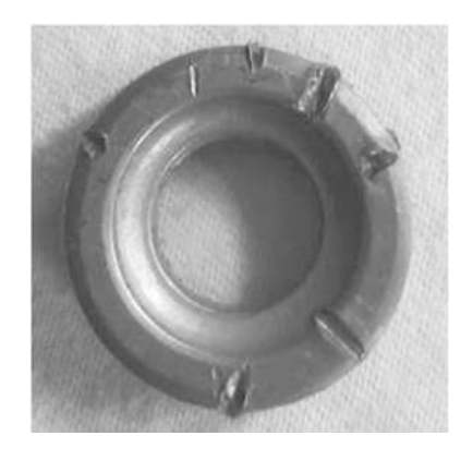
Figure 5. Ball bearing of Fidget