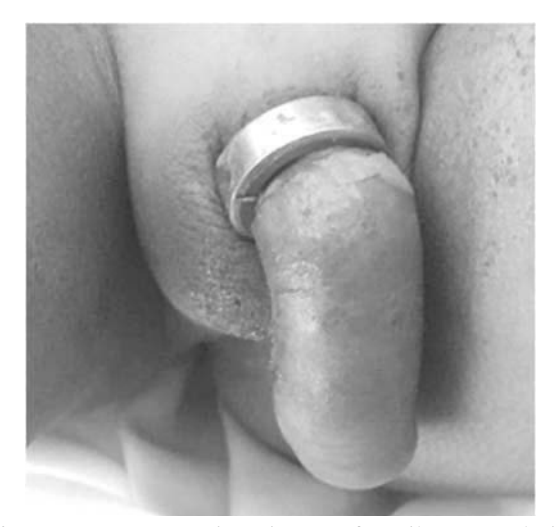
Figure 2. Pre-operative picture of penile strangulation