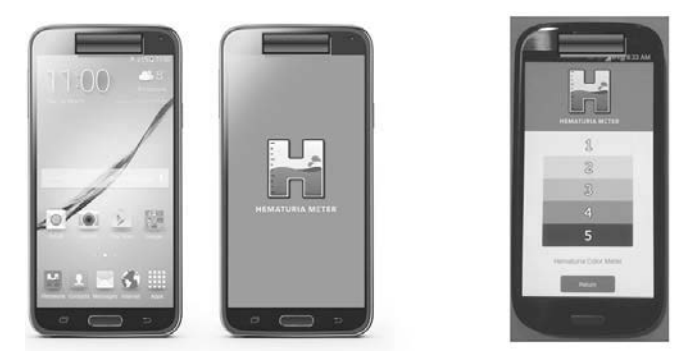
Figure 2 . Screenshots of hematuria meter application; A. Hematuria meter application icon and home page as seen upon opening the application, B. Hematuria color meter.

pinkish, 4 for bright red and 5 for dark red. The method to identify the colors used in the Hematuria Meter Application was replicated as described by Dr. Agtarap.<sup>3</sup>